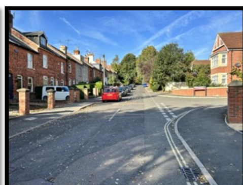
Avoid parking here –Thank-you